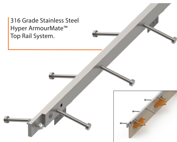
316 Grade Stainless Steel Hyper ArmourMate™ Top Rail System.